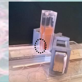
Diagram 1: 20µl Magnetic nanoparticles seen crossing the 1ml cuvette